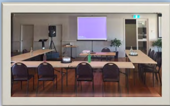
Conference Set up

Club Sunbury has a large area of secured parking for your guests and we look forward to sharing event with you and making it a success.