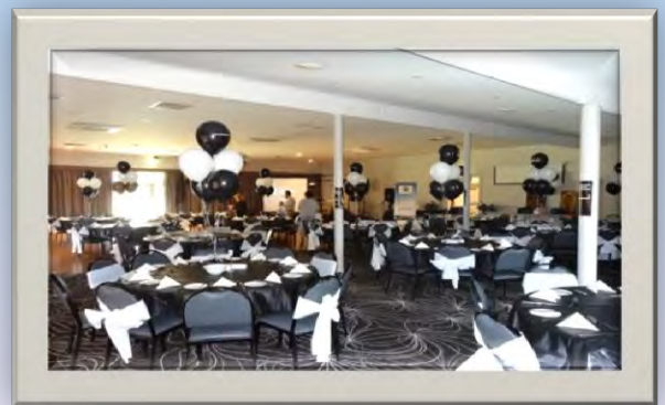
Dinner Set up